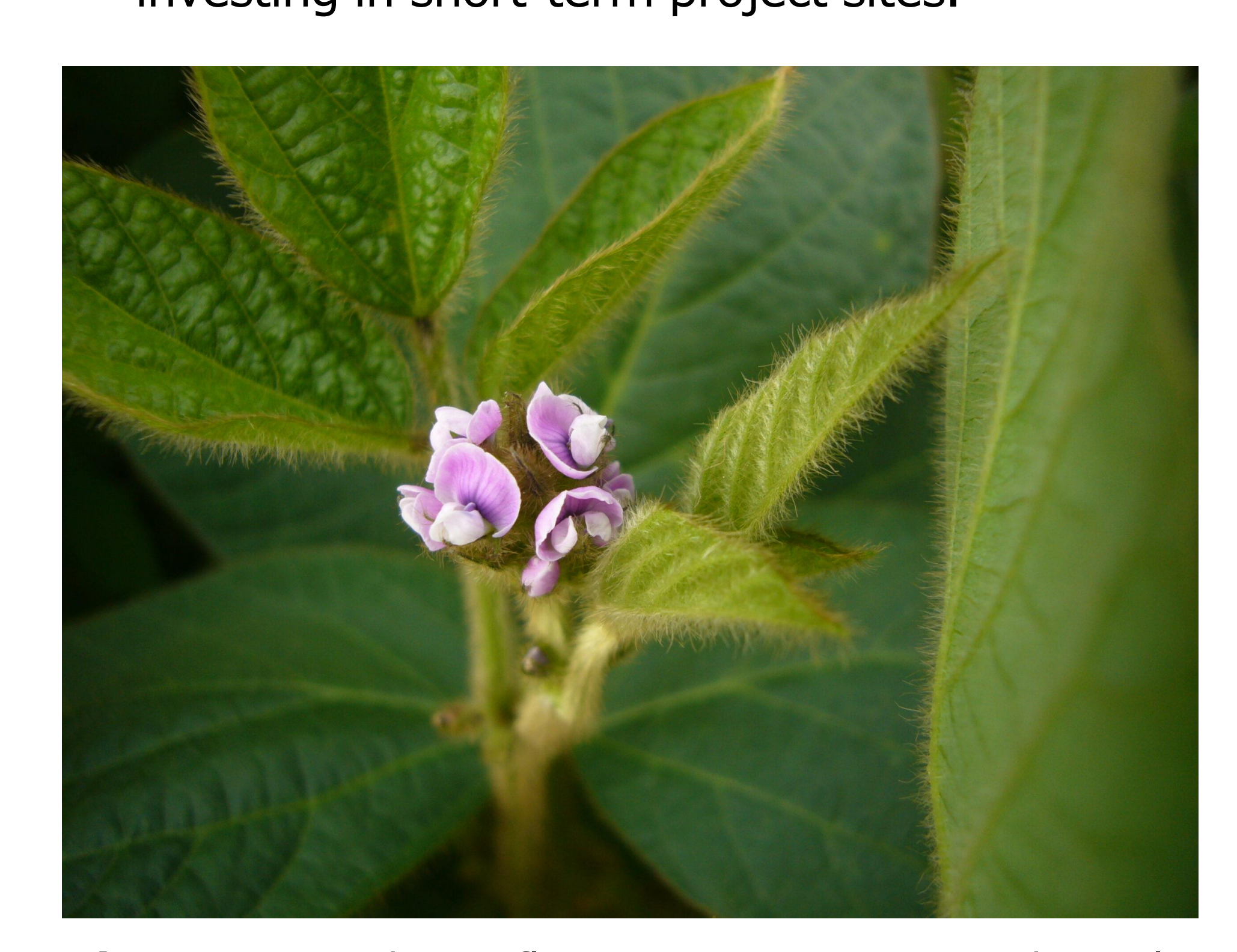
Figure 3. Soybean flowering