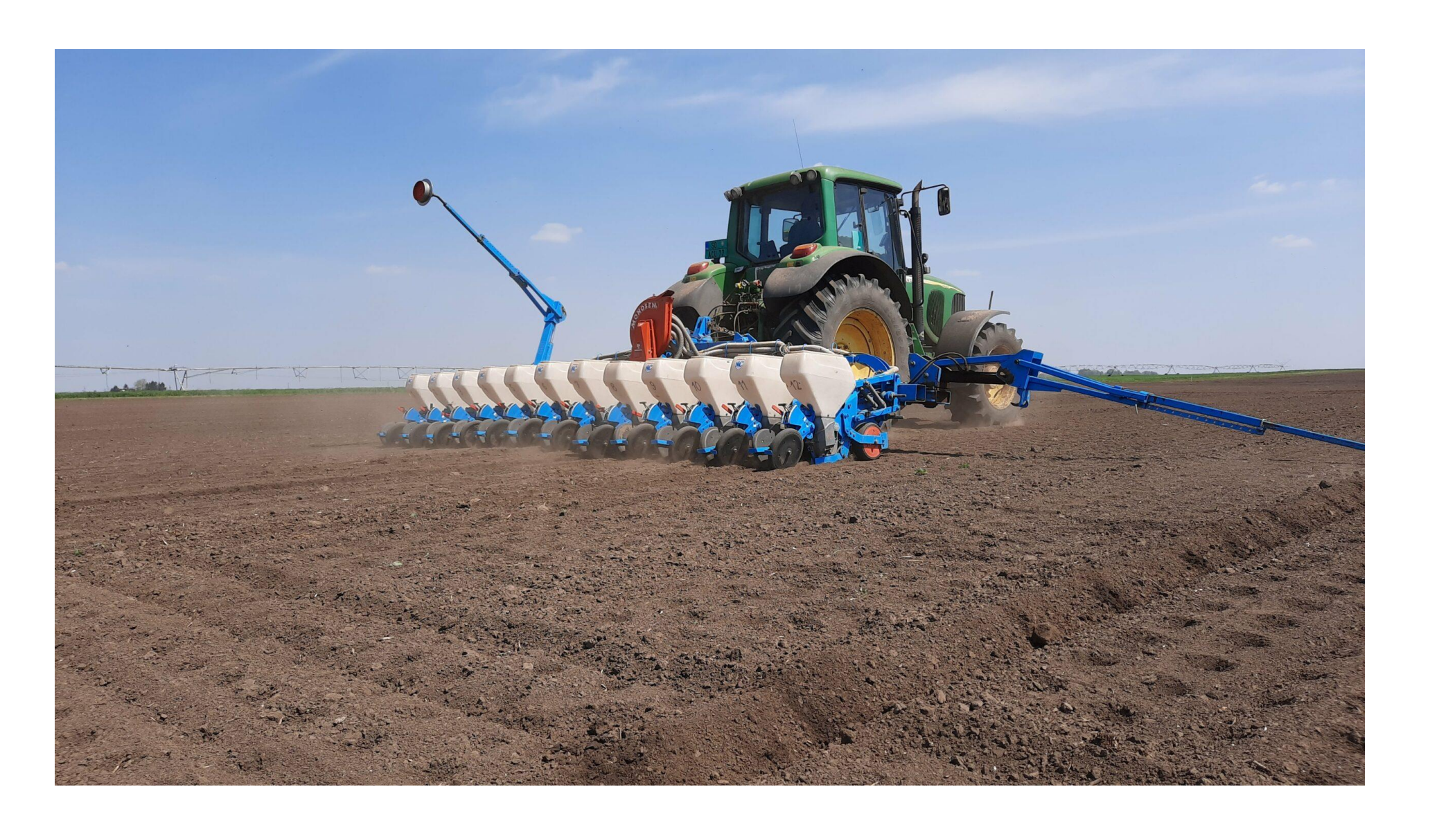
Figure 2. Soybean seeding

The Legume Hub provides articles, videos and images about soybean, lupin, pea, faba bean and lucerne. Currently, it provides 160 articles, whereof 70 on the topic of soybean.