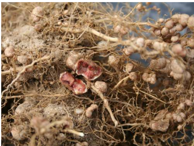
Figure 1. A close-up photograph of a split nodule showing the characteristic pink colour. This is indicative of a successful establishment of the rhizobium and active biological nitrogen fixation.

charged with oxygen. This explains why healthy root nodules are pink. The presence of a large number of nodules that are pink when split open is a reliable indicator of successful establishment of BNF in legumes crops (Figure 1).