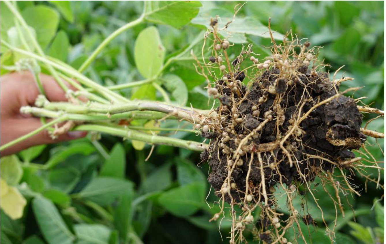
Figure 3. Nodulated roots of soybean plants from the field.

Bradyrhizobium lupini for lupins; Mesorhizobium loti for sulla and trefoil; Rhizobium vigna for cowpea and other Vigna species, peanut; Rhizobium simplex for sainfoin; Bradyrhizobium japonicum for soybean (Figure 3).