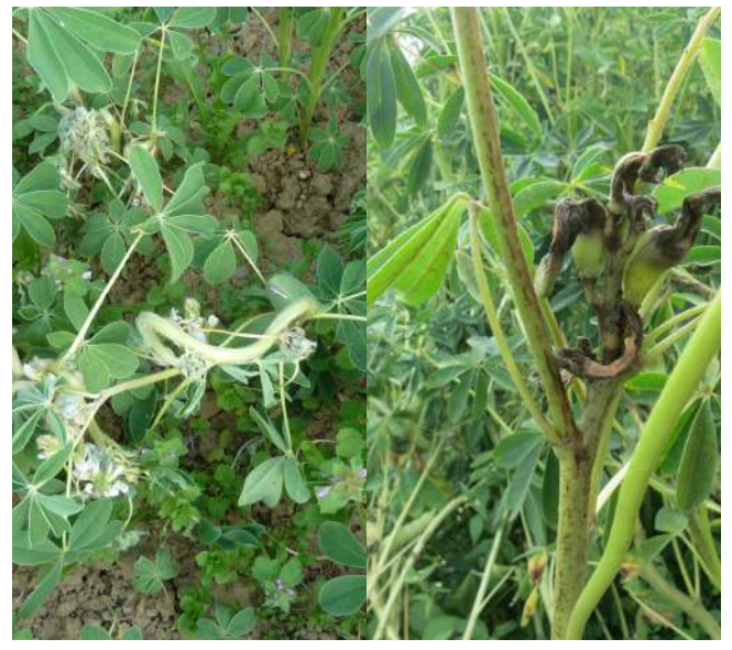
Figure 4. The dreaded anthracnose disease leads to localised twisted growth of whole plants at flowering time (left) and to black, twisted pods at maturity (right). The worst disease patches can be removed from the field by hand at flowering time.