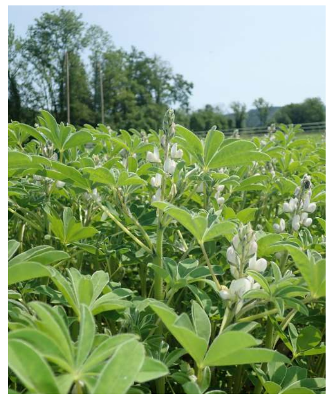
Figure 1. The white lupin

White lupin (Lupinus albus) is a different botanical species to narrow-leaved or "blue" lupin (Lupinus angustifolius). It tolerates heavier soil and has a higher yield potential, but does not ripen until August/September. Important cultivation practices include the use of healthy, certified seed, sowing as early as possible and using the right cultivar to reduce the impact of the fungal disease anthracnose, which is spread through the seed. The most important experiences from organic farming are summarised here.