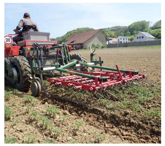
Figure 2. Weed control is particularly important for the prevention of late weeds. The crop can be weeded mechanically in the early stages.