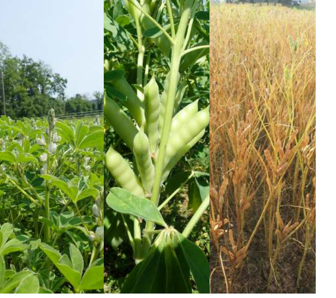
Figure 3. In flower, pods filing, and ripe white lupin