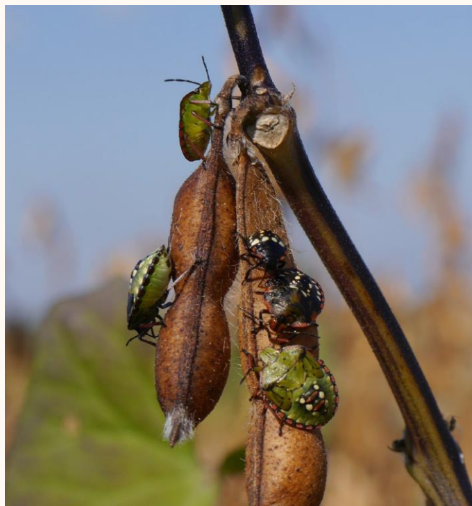
The different developmental stages of bugs can give the impression that different species are involved in the infestation. Depicted are three stages of the southern green stink bug.

However, the recently observed regional mass infestation, which raised the question of the damage potential of bugs in soy, was mainly caused by the newly introduced species "southern green stink bug" and "brown marmorated stink bug". Contrary to previous assumptions, they survive by finding protected hibernating spots even in regions where the average temperature in January is below 5°C.