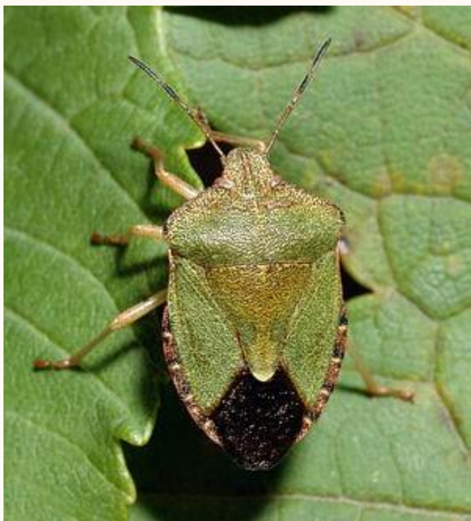
Native generalist, which can occasionally be found in soya: adult summer form of the green shield bug.

Bugs are very mobile, and many bug species are generalists. Accordingly, several species can be found in soybeans. Among the indigenous species, the green shield bug ( Palomena prasina ) and the European tarnished plant bug ( Lygus rugulipennis ) are found in soy.