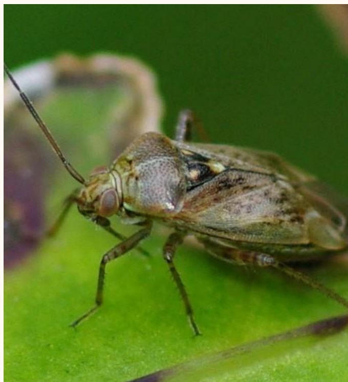
In rare cases, the European tarnished plant bug can occur massively in soy stands.

However, the recently observed regional mass infestation, which raised the question of the damage potential of bugs in soy, was mainly caused by the newly introduced species "southern green stink bug" and "brown marmorated stink bug". Contrary to previous assumptions, they survive by finding protected hibernating spots even in regions where the average temperature in January is below 5°C.