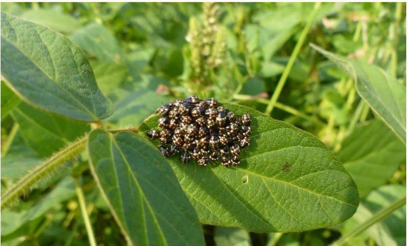
A strong bug infestation before ripening certainly has an effect on the soy yield.

In the case of soybeans, the earlier harvest of other host crops can lead to migration of bugs from harvested neighbouring crops. This has led to high infestations in some regions in recent years. However, as these events usually only occurred when the pods were maturing, significant damage is rare.