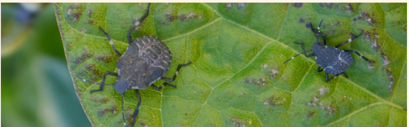
Nymph stages of the brown marmorated stink bug: The Chinese species is expected to establish in large parts of Central Europe.

Detailed publication of the LTZ on the brown marmorated marbled stink bug can be found here (in German).