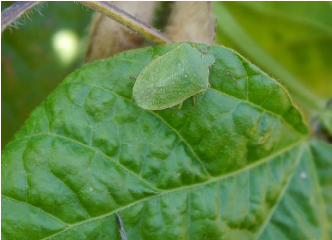
The southern green stink bug. The three white dots on the front of the back shield distinguish them from the native green shield bug.

The LTZ has published a good general description of the southern green stink bug: http://www.lalf.de/fileadmin/media/PDF/ps/themen/Nuetzlingstagung_2016/2016_11_30_Zm_Reiswanze.pdf