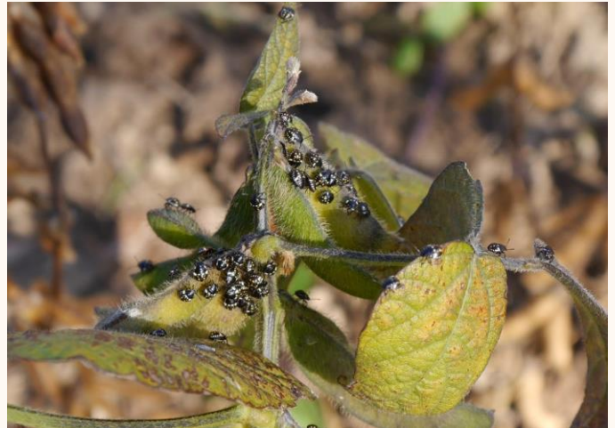
In some regions no longer a rare sight: mass infestation of soy by the southern green stink bug. Pictured is the third nymph stage.