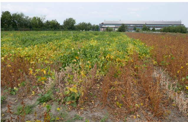
Soybean cultivars of different maturity groups on a research plot at the University of Natural Resources and Life Sciences Vienna.

Because the maturity group categorisation is only approximate, some descriptive cultivar lists go further and indicate a number of more or fewer days for maturity compared to a cultivar serving as a reference. This is done in Switzerland, Czechia, France, Hungary and Poland. Description lists in Austria and Germany provide numbers to distinguish between relatively early, medium and late cultivars within a maturity group. In Austria, earliness ratings 2-3-4 are allocated to MG 000 and 5-6-7 to MG 00. These more precise ratings consider the impact of the local effects of temperature and water supply on earliness. Local testing of candidate cultivars to examine these fine responses helps in local selection.