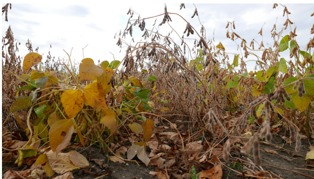
Soybean cultivars with different levels of resistance to lodging on a research plot at the University of Natural Resources and Life Sciences Vienna.

The second selection criterion is the standing stability or the resistance to lodging. This currently varies from grade 2 to 9 (with 1 = lodging very low to 9 = lodging very high) in the Austrian catalogue. Four grades are used in France (very low risk, low risk, pretty risky, high risk). The risk of lodging is increased by lush growth enabled by a good supply of water. Therefore, cultivars that stand well are preferred where lush, vigorous growth is expected. As a trait, standing ability is often linked to determinate development that shortens the flowering period which in turn reduces the length of the growing period. This leads to early ripening which may in dry years mean a yield disadvantage compared to indeterminate variety types. Crop height is not decisive for resistance to lodging. Tall cultivars tend to have fewer pods placed close to the soil. This results in lower harvest losses, especially where a flexible cutterbar is not used.