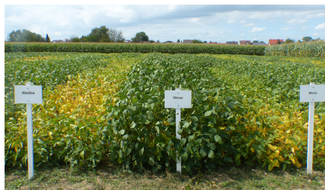
Cultivar differences in ripeness, vigour and stability.