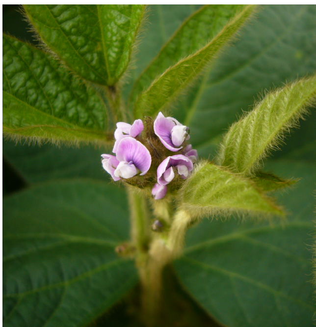
Soybean flower.

Depending on the autumn conditions of a site, harvesting in September is generally preferred while ripening in October runs risks with weather. The growing season from crop emergence in May is therefore short and cultivars that mature quickly are required in most of Europe. The soybean is by nature a so-called short-day and