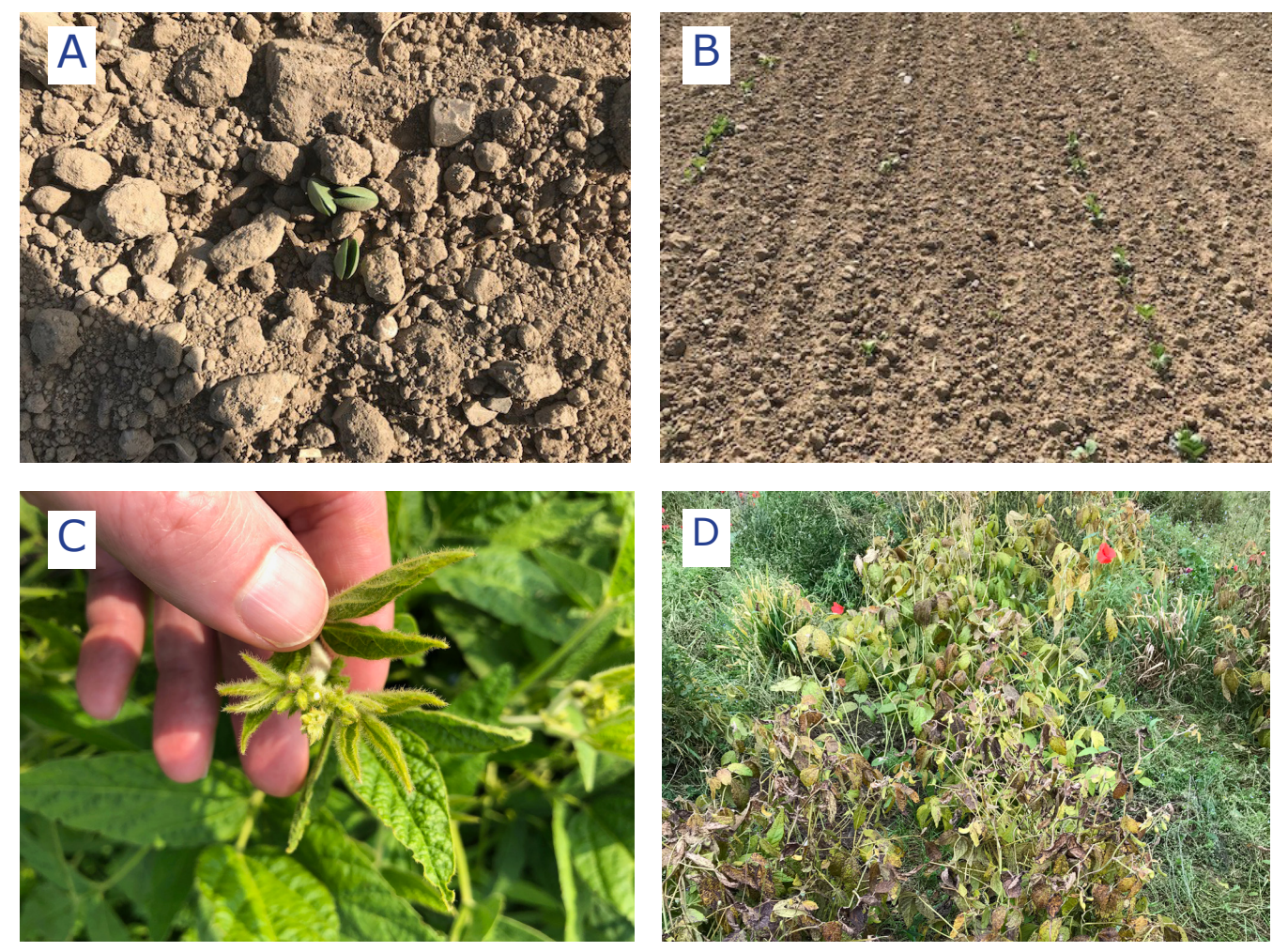
Figure 2. Pictures of soybean at different growth stages in 2020 at Oak Park research farm in Carlow, Ireland. A: Emergence (20/05/2020); B: Establishment (01/06/2020); C: Flowering (14/08/2020); D: Maturing plants (01/10/2020).

000 and 0000, are potentially suitable for Irish conditions. Based on authors' experience, about 2,600 CHU, or about 1150 GDD (base 10°C), are required from emergence to harvest. Based solely on CHU, soybean production may be feasible in areas of County Cork, such as around Cloyne, Linsaley, where calculated CHU were close to those observed in German soybean producing areas such as in Tailfingen (altitude 450 m) and Ochsenhausen (altitude 625 m) in Baden-Württemberg (Figure 3). In the other locations considered, the CHU were lower than the minimum required in at least 3 out of 10 years, and never surpassed 2,500. However, considering that more daylength may substitute some low temperature, it might be interesting to test soybean cultivation for several years also at those places and evaluate if this effect is sufficient for a sustainable production. Ideally, pea and/or faba bean will also be sown to get an idea about the relative performance of those 3 grain legumes at each site.