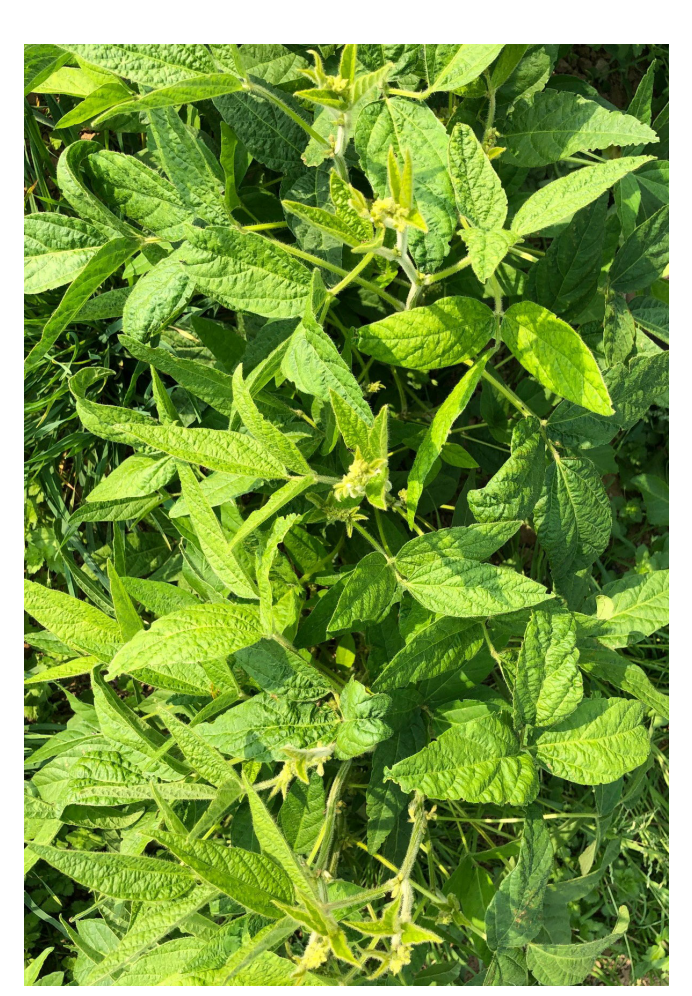
Soybean flowering.

degree-days (GDD), using 10°C as the base temperature. Crop heat units (CHU) are also used. The calculation of CHU uses 10°C and 4.4°C as the daytime and night-time base temperatures respectively. The minimum reported values for soybean are 933–1,041 GDD (base 10°C) and about 2,300 CHU. This requirement for heat and for day neutral cultivars makes the production of soybean above about 52°N (approximately the line from Cork in Ireland to London across to Berlin) particularly challenging, especially in north-west Europe where long summer days are combined with relative cool maritime conditions, such as in Ireland.